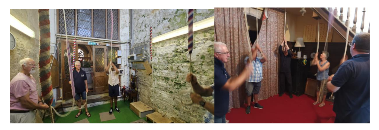
Above Left: Ringing up at Dallington. Above Right: Ringing at Ashburnham.

Beginning to overheat, we made our way down to Ashburnham, where again the ringing chamber is lower than the nave of the church. Getting these bells was tricky, as sadly there is no band here and the contact details were out of date. I'm glad we did manage to get them though, as they are a lovely, easygoing ring of 6, which were augmented from a 4 in the mid-90s. If you haven't been, the church itself is within the grounds of Ashburnham Place, rather than the village itself, and this made it a handy place to visit before lunch, as Ashburnham Place has a restaurant in beautiful surroundings.