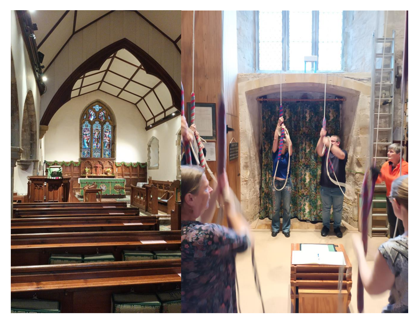
Top left: Ringing at Heathfield. Above left: Waldron's beautiful interior. Above right: Call Changes at Waldron.