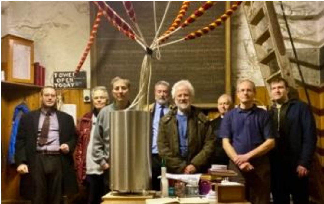
Above: The band, clockwise from front right.

The peal report can be found here: Ringing World BellBoard