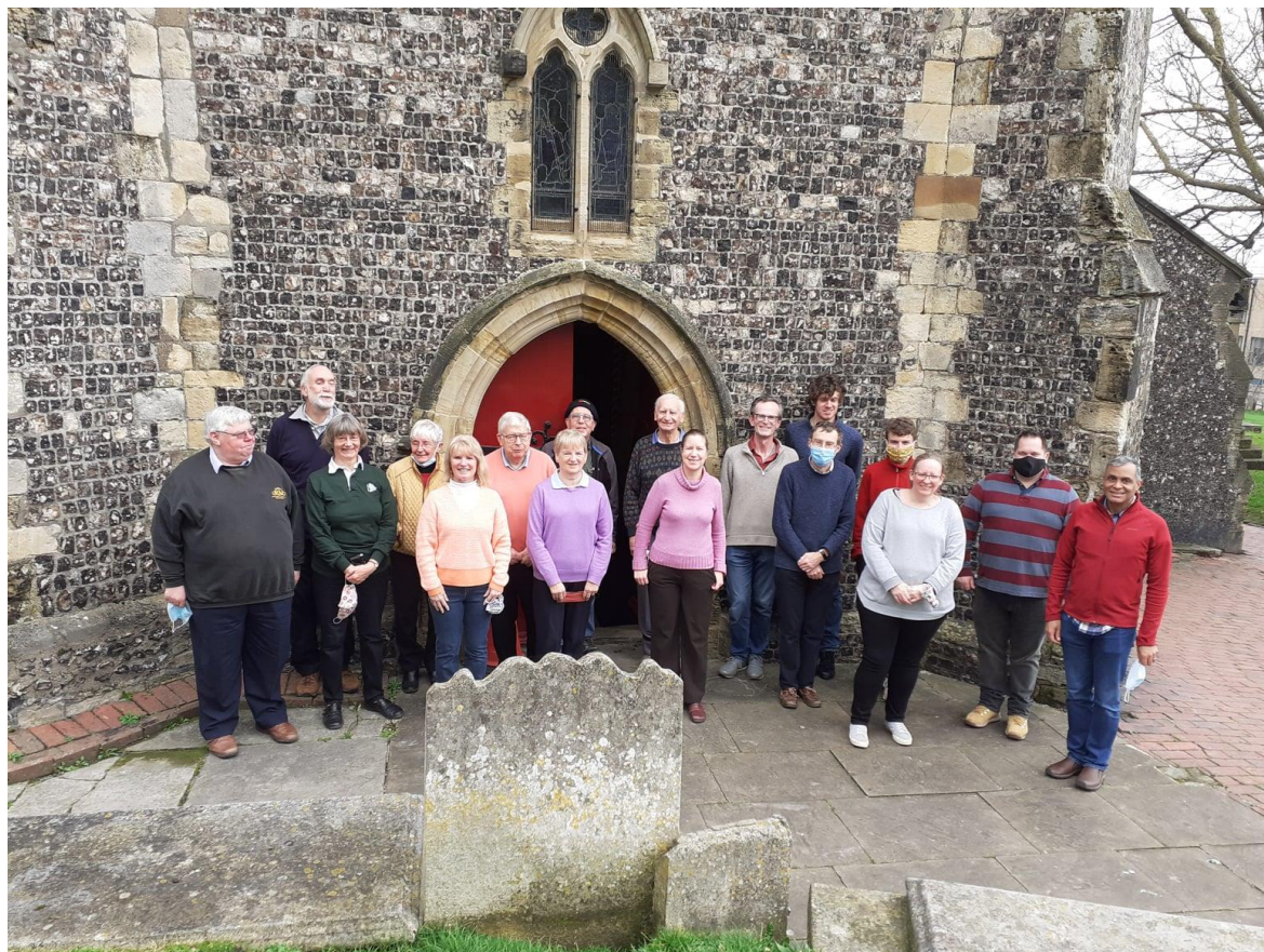
Ringers at St Nic's Brighton, 18 th December 2021