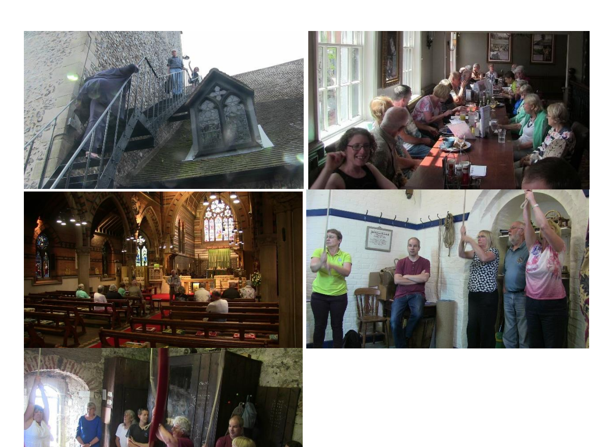
L-R: Stoke Poges, The Bear PH, Maidenhead, All Saints, Maidenhead, Wraysbury, Horton