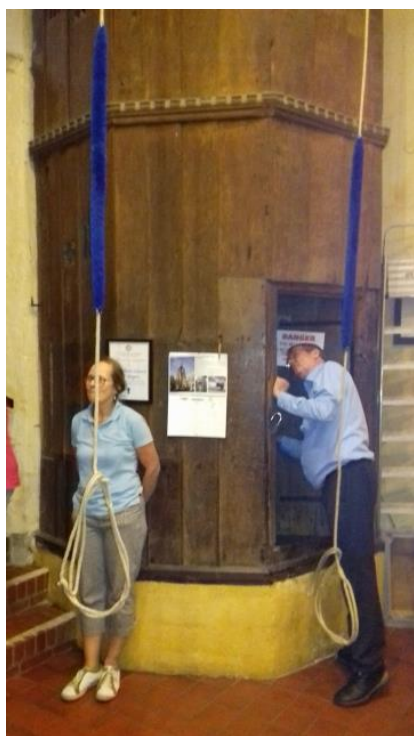
Where's that spider?