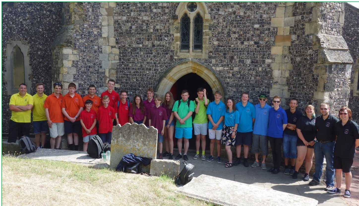
The group, resplendent in our rainbow polos, outside St Nicholas, Brighton.