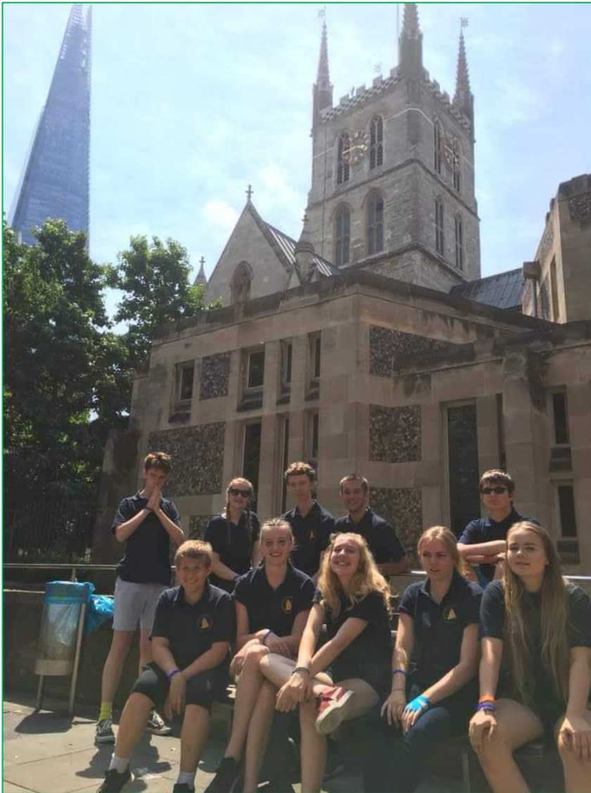
Team Sussex outside Southwark Cathedral

Time passed and the chimes of St James struck half past three, meaning this was the time for Sussex to shine. After applauding Team Bedfordshire for their exceptional ringing, we gave our final hugs to our team leaders and our Sussex supporters and made our way one by one up the spiral