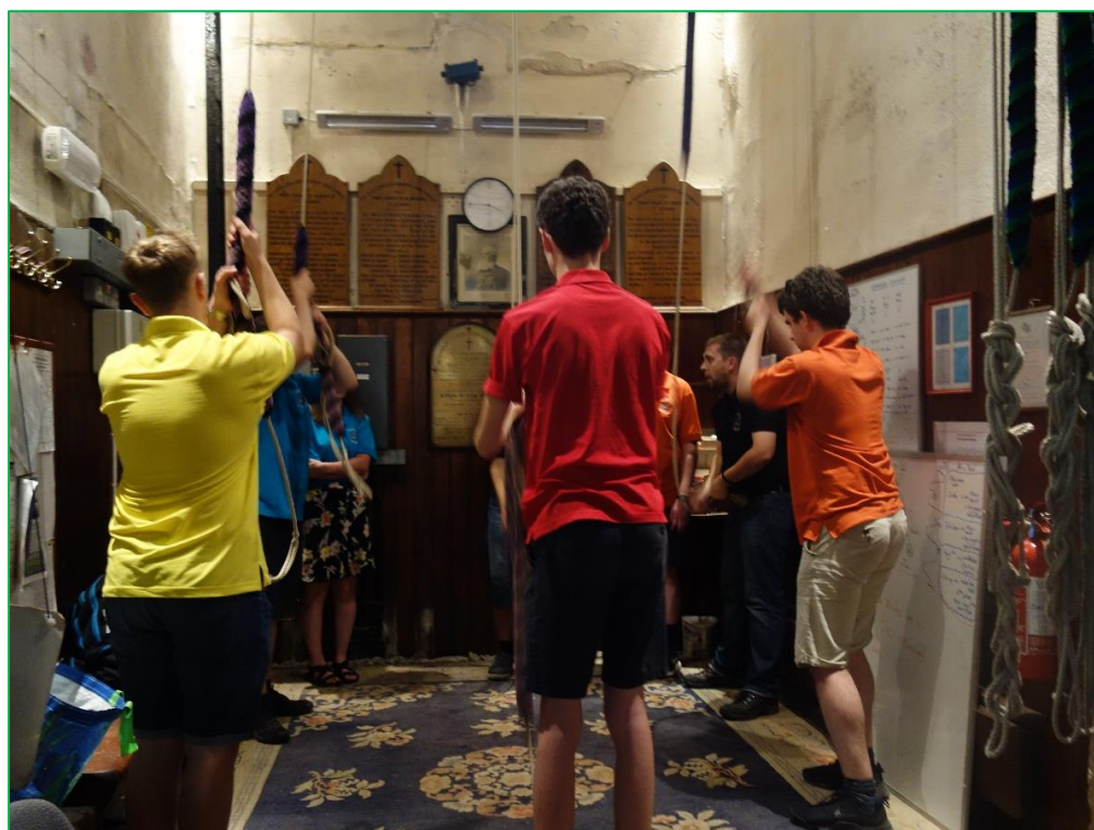
Ringling at Aldrington

After three years in Poole, it was time to move the Tour on, and Sussex were the lucky recipients this year, as we based ourselves at the Parkwood Scout Campsite in Poynings, near Hurstpierpoint. This venue proved ideal both in terms of comfort and location, situated in fabulous countryside.