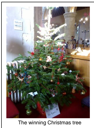
The winning Christmas tree