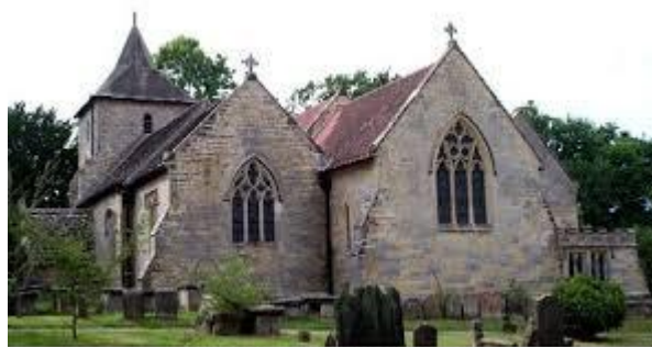
St Mary's Church in Balcombe, circa 2000

The bells of St Mary's are ringing again! Work was finally completed on Monday 17 th March when Whitechapel returned with the headstock from the third bell in the ring of eight and fitted it, thus completing the work. This had held things up a bit when it was discovered that this headstock had a loose gudgeon pin (these stick out of the ends of the headstock and allow the bell to swing). The main bearings are mounted on the gudgeon pin and these proved difficult to remove, but were due for replacement. In the event, the Bluebell Railway came to the rescue and got the bearings off in their heavy engineering workshop at Sheffield Park, but could not replace the gudgeon itself, so new ones had to be made and fitted to the headstock at Whitechapel.